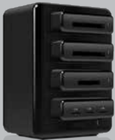
Professional Workflow HR1 (USB 3.0 hub)