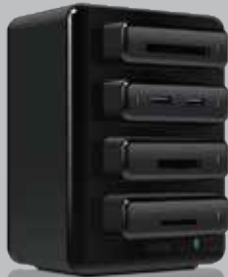
THUNDERBOLT. Professional Workflow HR2 (Thunderbolt™ 2 and USB 3.0 hub)